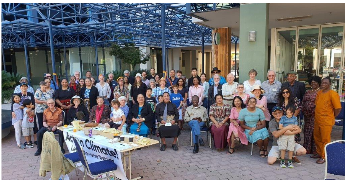
Photo 3: Picnic in the Plaza, Easter Day, 4 April 2021.

What is encouraging is that members of the Canberra City Congregation often meet the same people at events we support or organise. They may come from other Uniting Church congregations, other