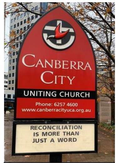
Photo 1: Canberra City Uniting Church's notice board facing Northbourne Avenue in May 2021.

The Canberra City Congregation aims to be a lighthouse church, showing the way for others. This is part of our calling as followers of Christ.